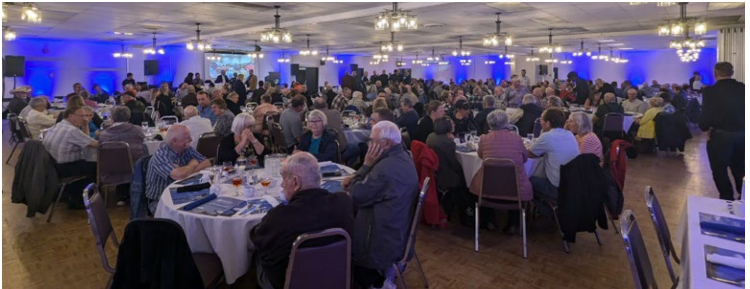
Pictured above: 2025 AGM

We would also like to thank the Days Inn & Conference Centre by Wyndham Camrose Norsemen for hosting our event, and E Sound Pro Audio & Lights for their expert support.