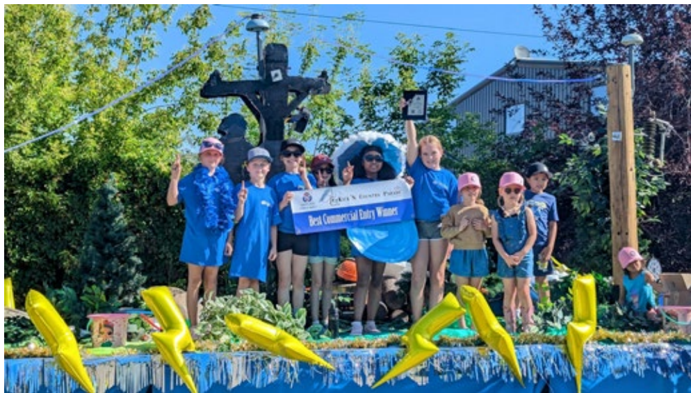
Battle River Power Coop's award-winning float.

Thank you to everyone who helped make this success possible. We are honored to represent our community and grateful for the recognition.